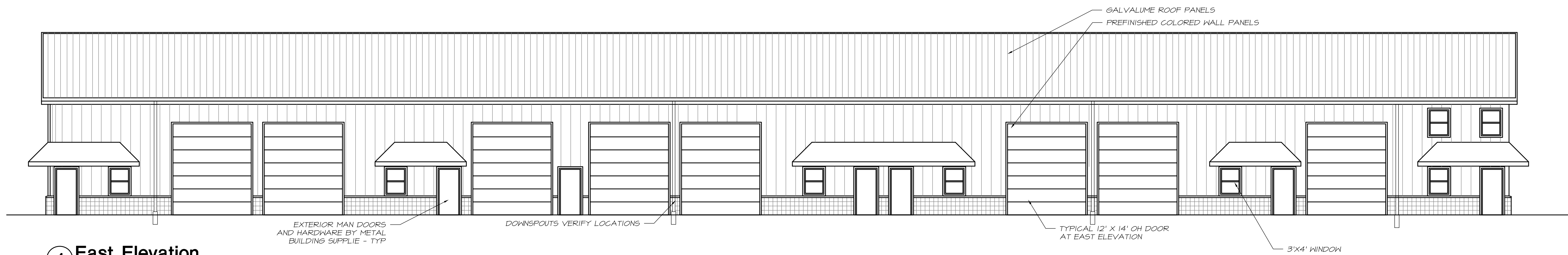
1 East Elevation 1/8"=1'-0"

9-25-15 Proposed Floor Plan 10-5-15 Elevations Added 2-28-16 Revised 3-3-16 Revised